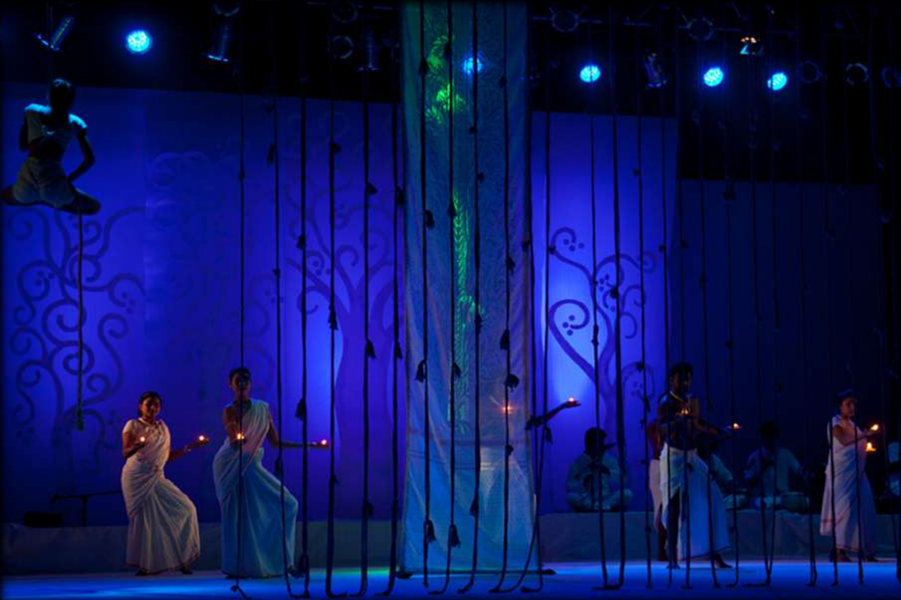
SARI-the show, highlights the stages in the journey from the cotton pod...